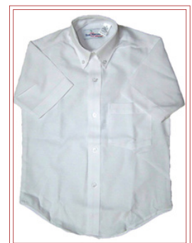
CHAPEL ATTIRE - OXFORD SHIRT

KPrep-8th: Assorted Fridays and Special Events